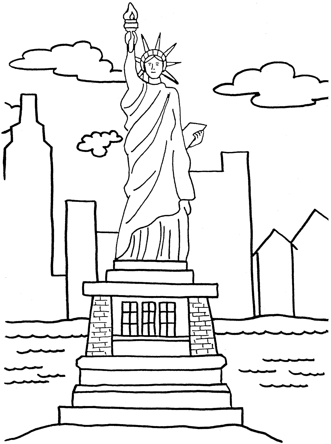
The Statue of Liberty.